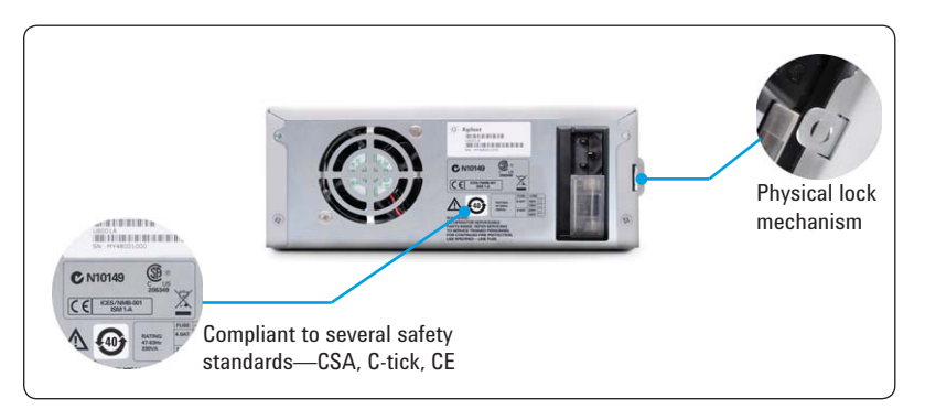
Figure 3. Safety and security features of the U8000 Series single output DC power supplies