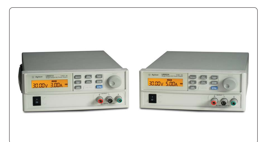
Figure 1. The U8001A 90 W and U8002A 150 W single output DC power supplies

Security features: keypad lock and physical lock mechanism